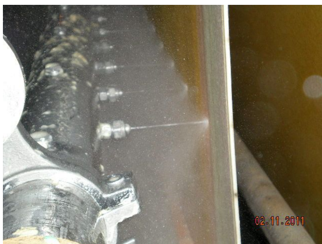
Figure i. High pressure needle showers can effectively cleaning localized sections of the press fabric

Compared to a method that applies the cleaning chemistries across the entire fabric width, the high pressure needle jets allows a more effective concentration to be achieved in the localized felt section being cleaned at a given moment. Figure (i) shows a typical high pressure needle shower on a press fabric.